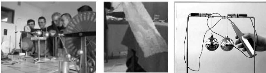
Fig.1. "Voltage" sources: a) Wimshurst's tribological machine (the right part of the photo), b) silk scarf taken from a woollen coat doesn't hang vertically, c) piezoelectric gas-lighter used for "Christmas experiment".

By the name "electricity sources" we summarize different ways of generating the current or the voltage, DC or AC. Historically first was tribology, i.e. generating voltage (and little current) by friction. Otto von Guericke at about 1660 used a sulphur ball rubbed by hand. It took many years before the modern version of the electrostatic machine, made of two plastic disks rotating in opposite directions, was constructed by J. Wimshurst in the 1880's. But its principle is the same as in the experiment with a silk scarf taken out from a woollen coat, fig.1b. When you fold it in half the two ends repel each other, like the two metal leaflets in Volta's electroscope. Quite high voltage can be obtained from a piezoelectric lighter – one has to take-off the metallic cup and connect isolated wires to the two electrodes. Coulomb's experiment can be reproduced by using this lighter and two Christmas tree balls made of thin glass and metalised inside, hanging on thin wires, fig. 1c.