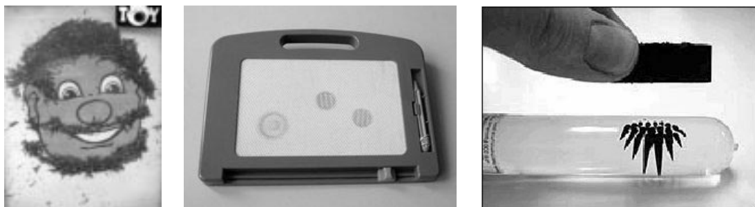
Fig. 6. Three devices to show the magnetic field lines. a) and old play with sub-millimetre iron filings, b) a novel screen for drawing for children, made of micro fillings suspended in paraffin oil; c) Ferro fluid cell

To visualize magnetic field one can still use sub-millimetre iron filings, fig. 6a, but this toy does not allow to show details of magnets. These tiny structures are shown in fig.6b, where the traces of two cylindrical magnets are compared: that to the left is a magnet from levitating donuts, these to the right are two magnets used to fix remember-notes on the fridge case. These latter magnets are multipoles : on the same face, north and south poles form successive stripes. This second "detector" is a drawing-pad for children – a thin layer of micro fillings, suspended in a paraffin oil between two walls (the front one is transparent). A "cancel" bar is a strip of unipolar magnet, moved below the screen. The fig.6c shows a ferromagnetic fluid, allowing to show 3-D distribution of magnetic fields. Unfortunately the liquid deteriorates quickly.