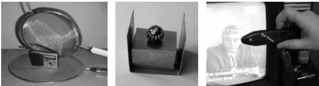
Fig. 7. Shielding and detecting EM fields. a) a sieve is enough to shield FM (in the 100 MHz range) radio waves, but can be not sufficient to shield the GHz fields used in cell phones – some field penetrates though the holes of the sieve; b) magnetic field are shielded by a box made of a high magnetic- permeability metal; c) a detector of AC wires inside walls is enough sensitive to detect also HF electromagnetic fields outside TV screen or near the doors of the microwave oven.

In fig. 7c we show a detector of electromagnetic waves – an AC tester for house workers, used to detect wires inside walls. It is enough sensitive to show leakage from a microwave oven and show the health hazard from staying close to the TV screen.