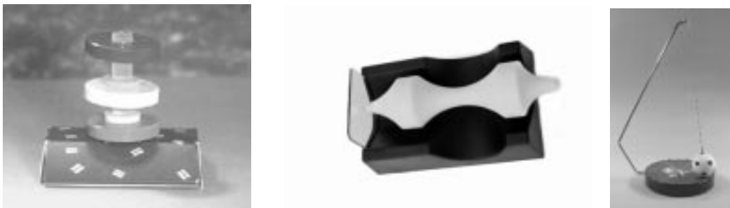
Fig. 4. Magnetostatic interactions: a) donuts, with poles on upper and lower bases are blocked in two directions by the stick; b) in the levitation pen one pole is on the external, lateral side of the donuts inside the pen; the repulsive interaction pushes the pen up (against the gravity) and left, against the barrier; c) in the roulette it is the cord from above which prevents the ball from flying apart left and right.

Levitation can be used to show the magnetostatic interactions, but not only. The key point in levitation is the stabilization of the interaction, by constraints, or some feedback. The simplest case in the two-dimensional constraint, in fig. 4a the magnets are simply bi-polar, with poles on upper and lower basis of the donuts. The stick prevents the magnets from sliding aside. In the levitating pen, fig.4b, the mechanical constraint is just in one point. But in this case magnets are two inside the pen – still donuts, but with poles on the external and internal side of the donuts. The same sign poles as on the external side of the donuts are placed in the upper part of the base. This mutual configuration of poles in the base and donuts pushes the pen up and left (on fig. 4b) – the mechanical barrier blocks the pen from going too much to the left. In the magnetic roulette, fig. 4c, all six poles in the basis repulse the ball and the fun consists in the instability of the system.